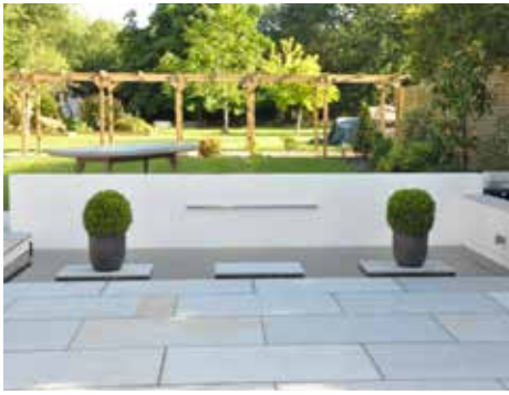
↑ ProJoint<sup>™</sup> Fusion (mid grey) on natural stone paving.

\textit{ProJoint}^{\text{TM}} \ \textit{Fusion (neutral/buff) on natural stone paving}.